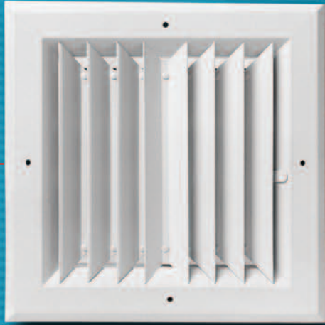
Sidewall/Ceiling Diffuser 2-way