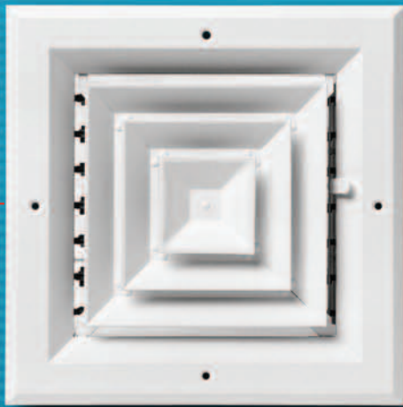
Sidewall/Ceiling Diffuser 4-way