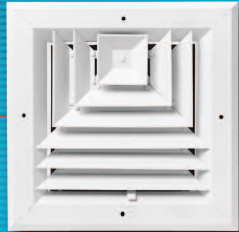
Sidewall/Ceiling Diffuser 3-way