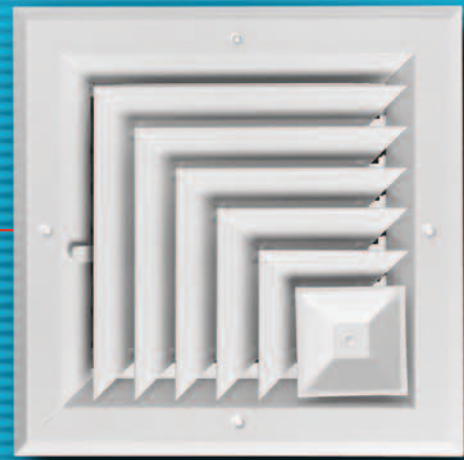
Sidewall/Ceiling Diffuser Corner

Available in six sizes: 6x6, 8x8, 10x10, 12x12, 14x14